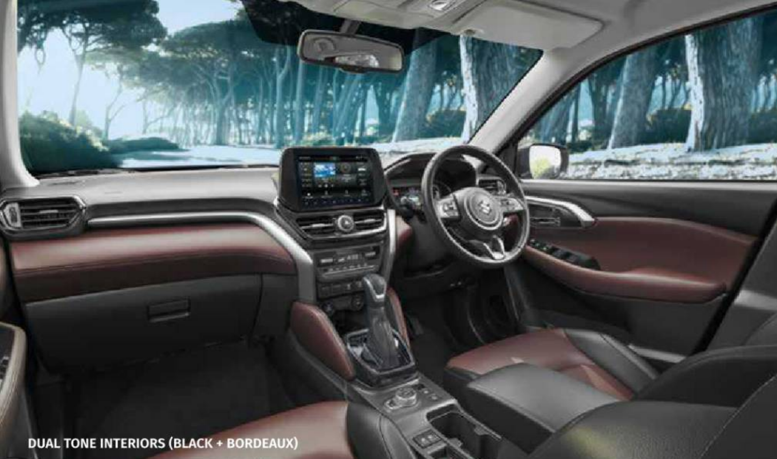
DUAL TONE INTERIORS (BLACK + BORDEAUX)