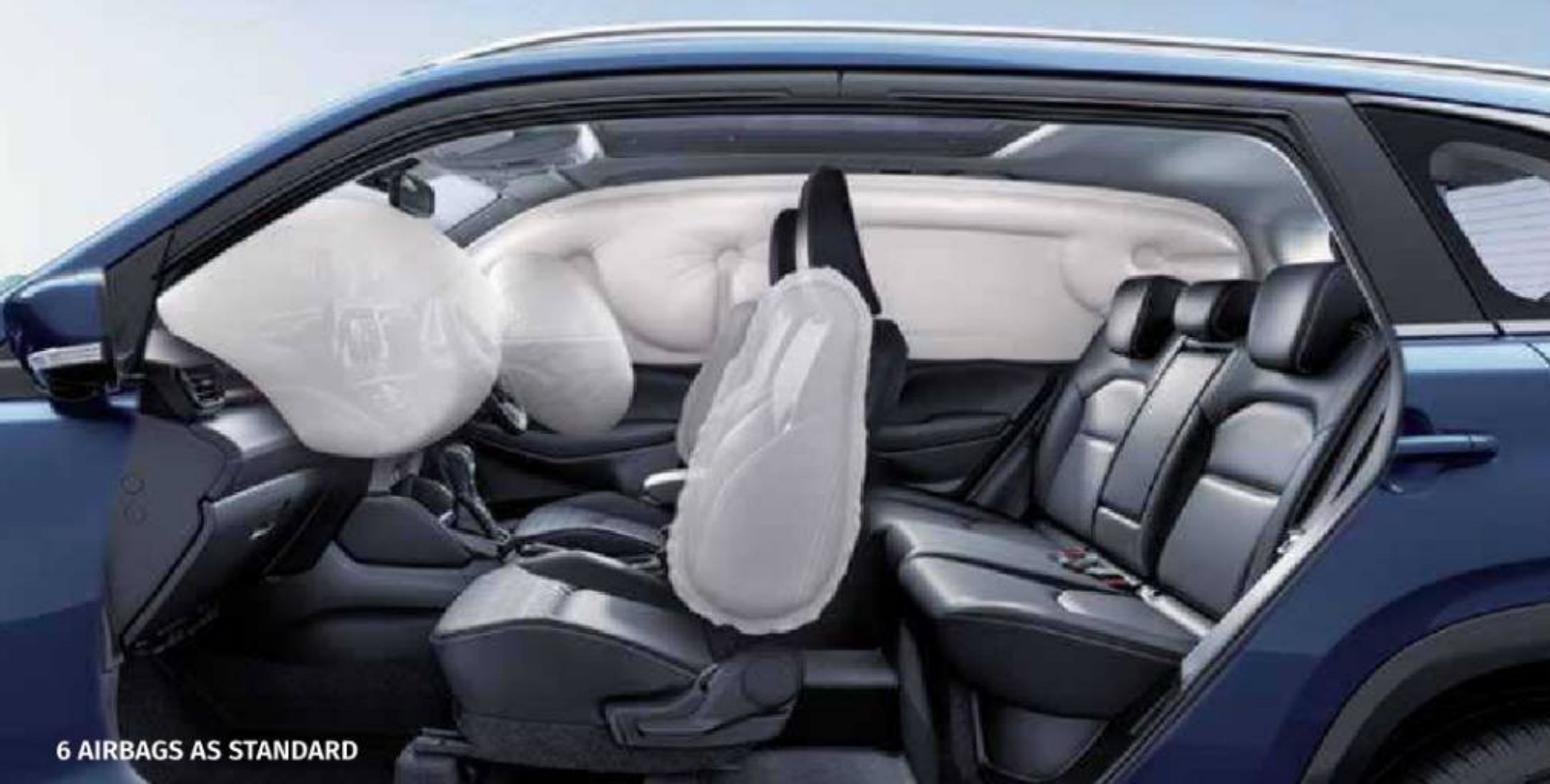
6 AIRBAGS AS STANDARD