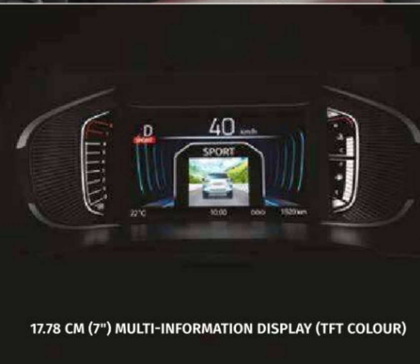
17.78 CM (7") MULTI-INFORMATION DISPLAY (TFT COLOUR)