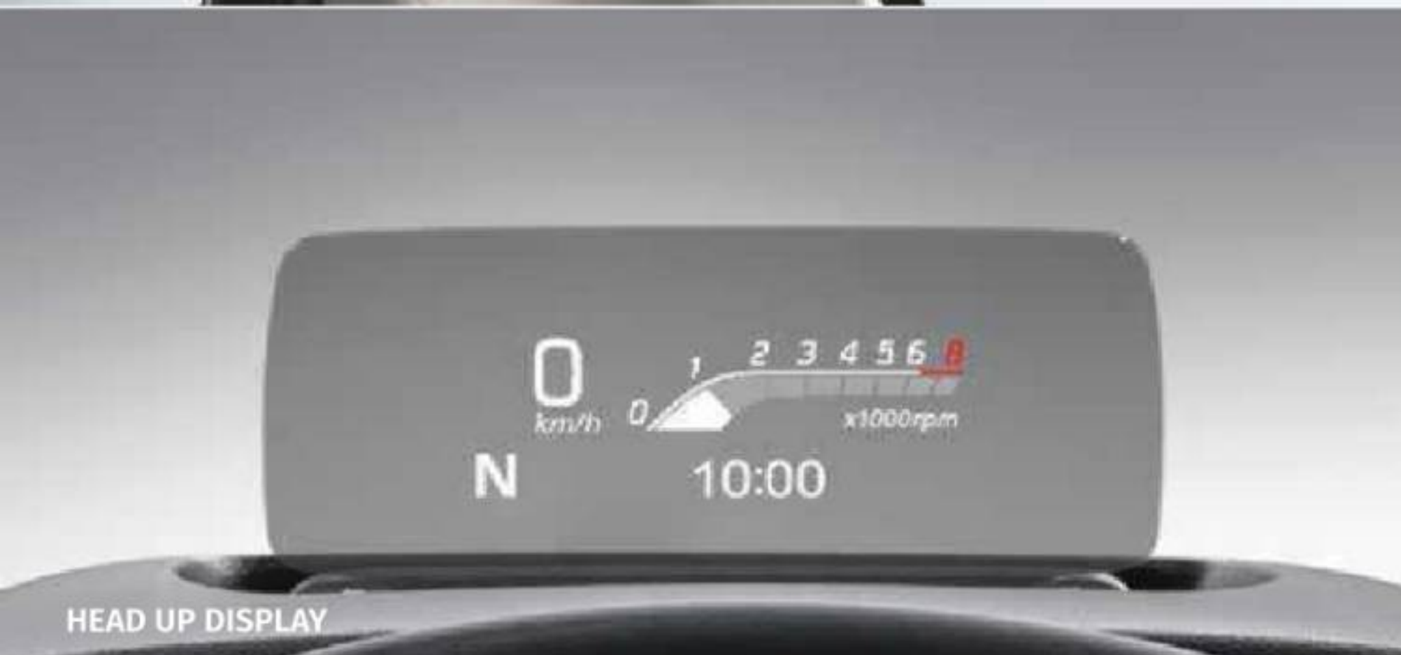
HEAD UP DISPLAY