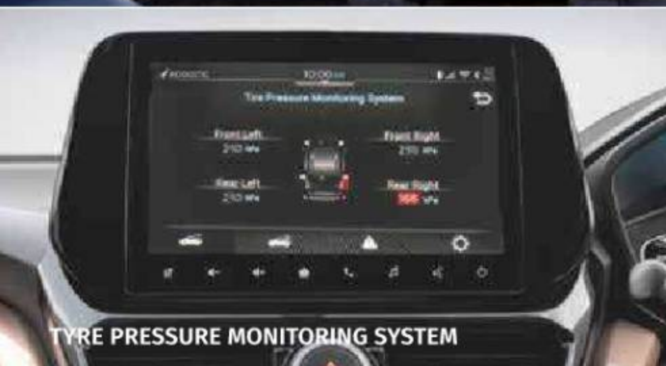
TYRE PRESSURE MONITORING SYSTEM