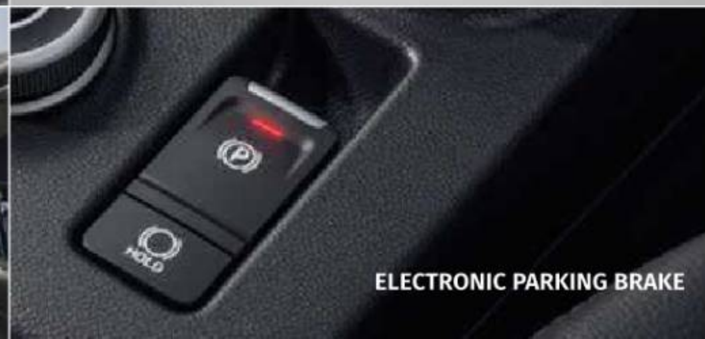
ELECTRONIC PARKING BRAKE