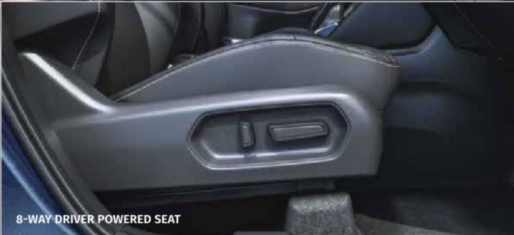
8-WAY DRIVER POWERED SEAT