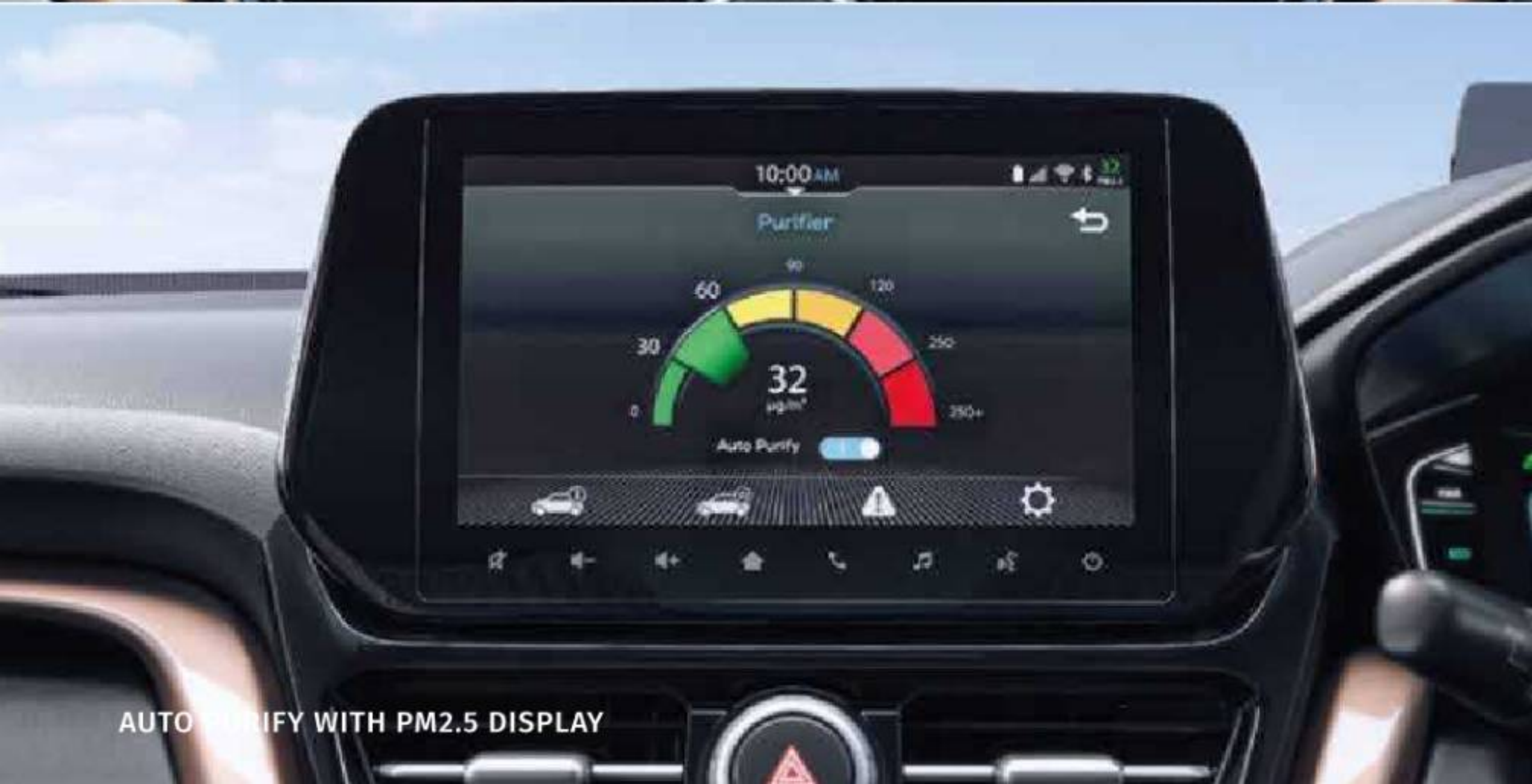
AUTO PURIFY WITH PM2.5 DISPLAY