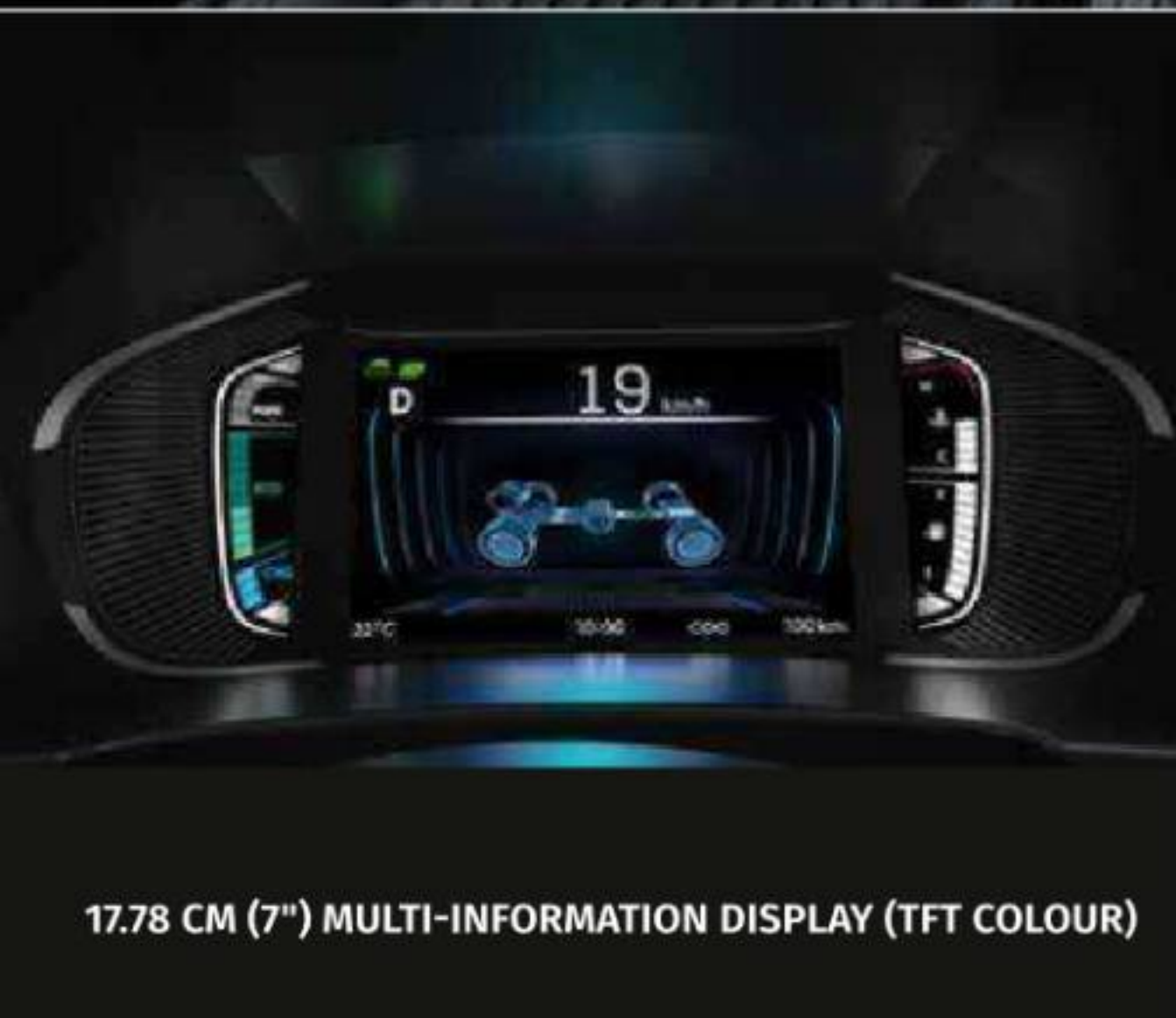
17.78 CM (7") MULTI-INFORMATION DISPLAY (TFT COLOUR)