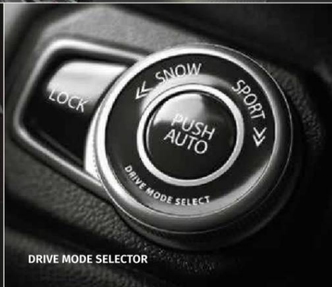
DRIVE MODE SELECTOR