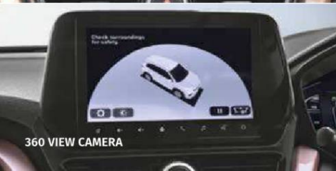
360 VIEW CAMERA