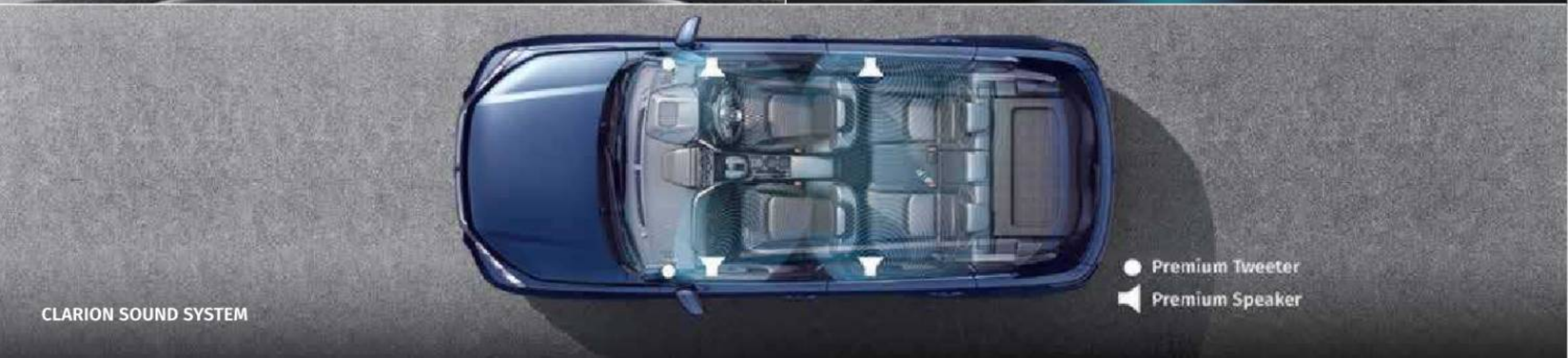
CLARION SOUND SYSTEM