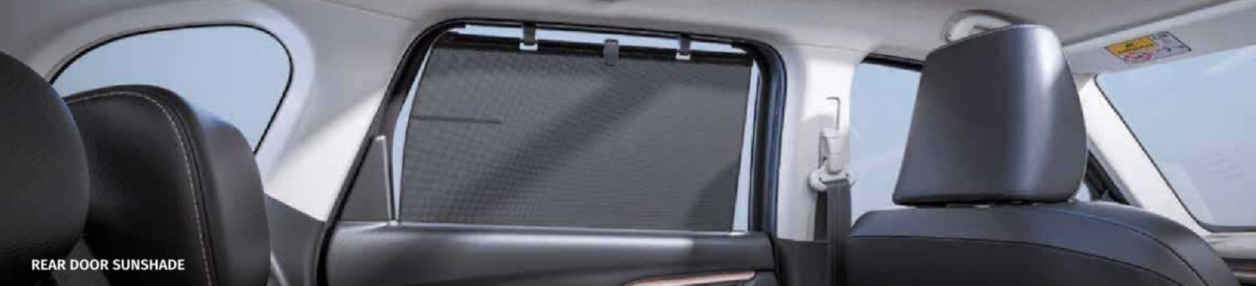
REAR DOOR SUNSHADE