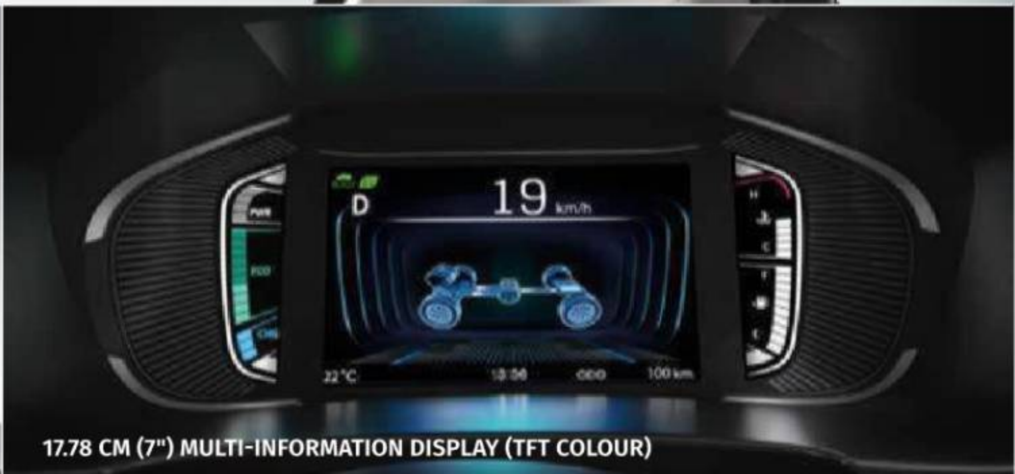
17.78 CM (7") MULTI-INFORMATION DISPLAY (TFT COLOUR)