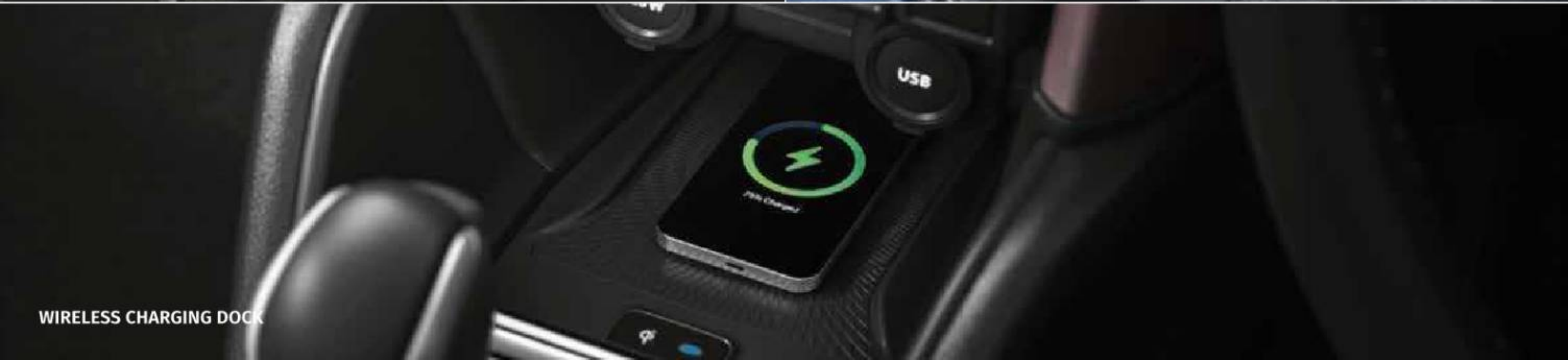
WIRELESS CHARGING DOCK