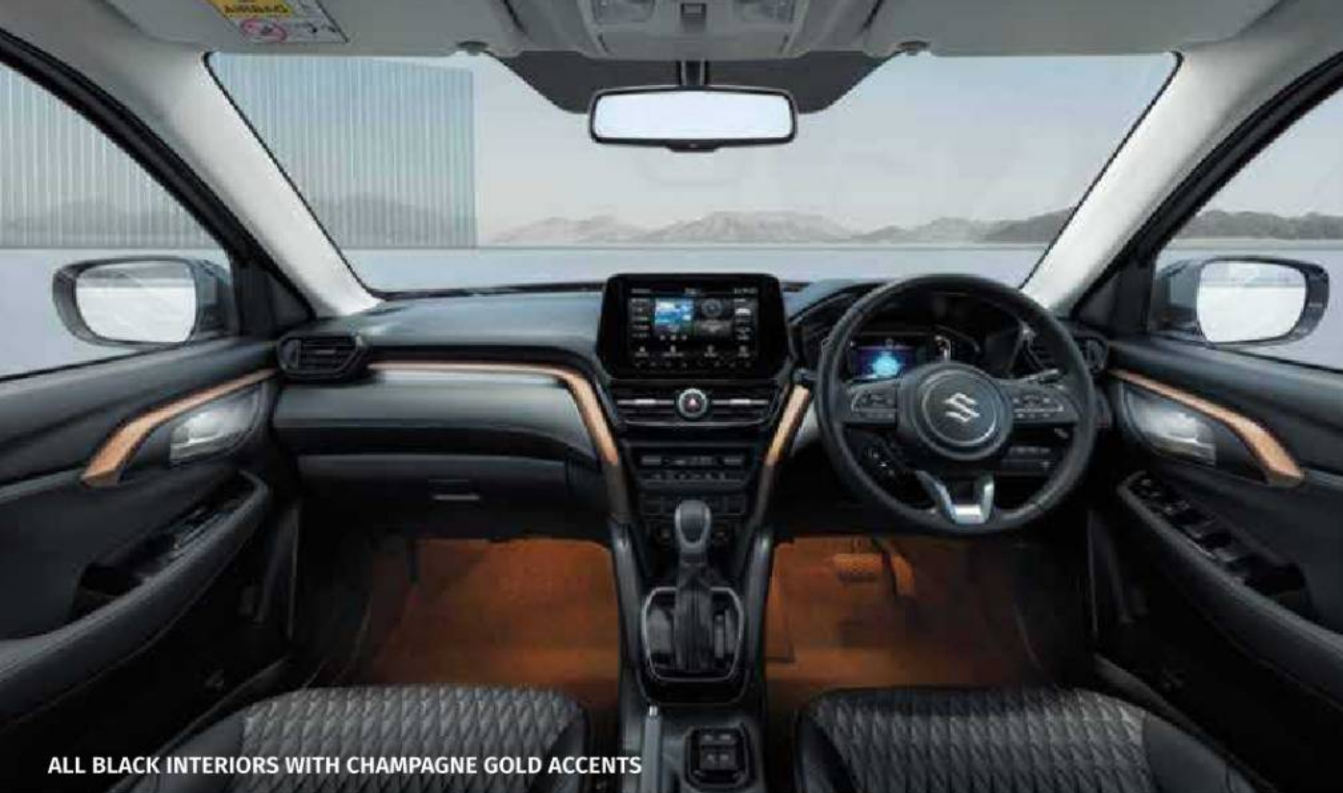
ALL BLACK INTERIORS WITH CHAMPAGNE GOLD ACCENTS