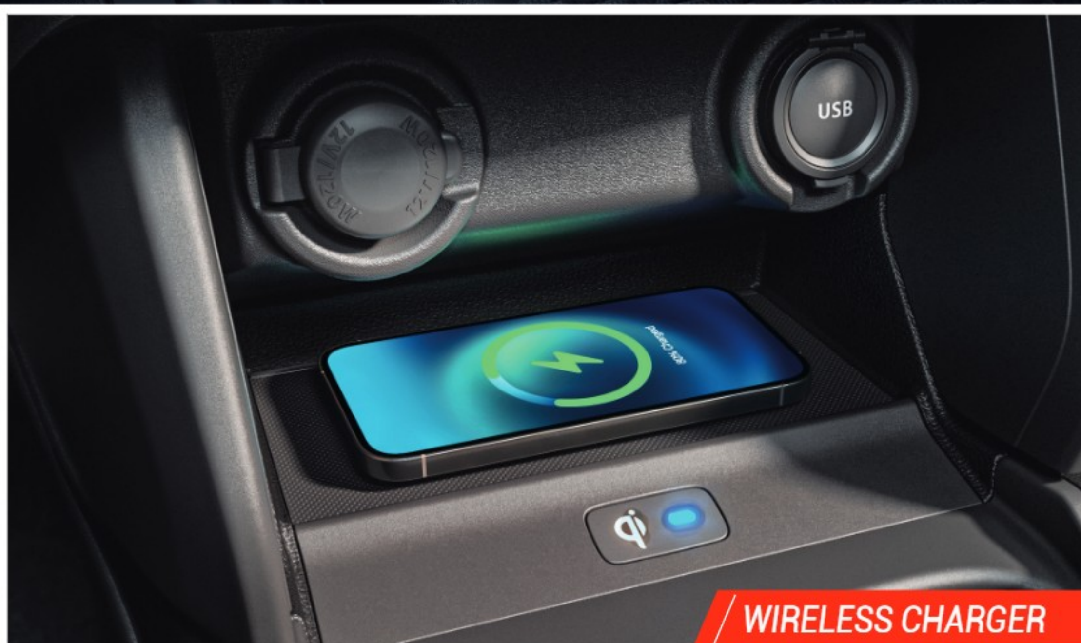
/ WIRELESS CHARGER