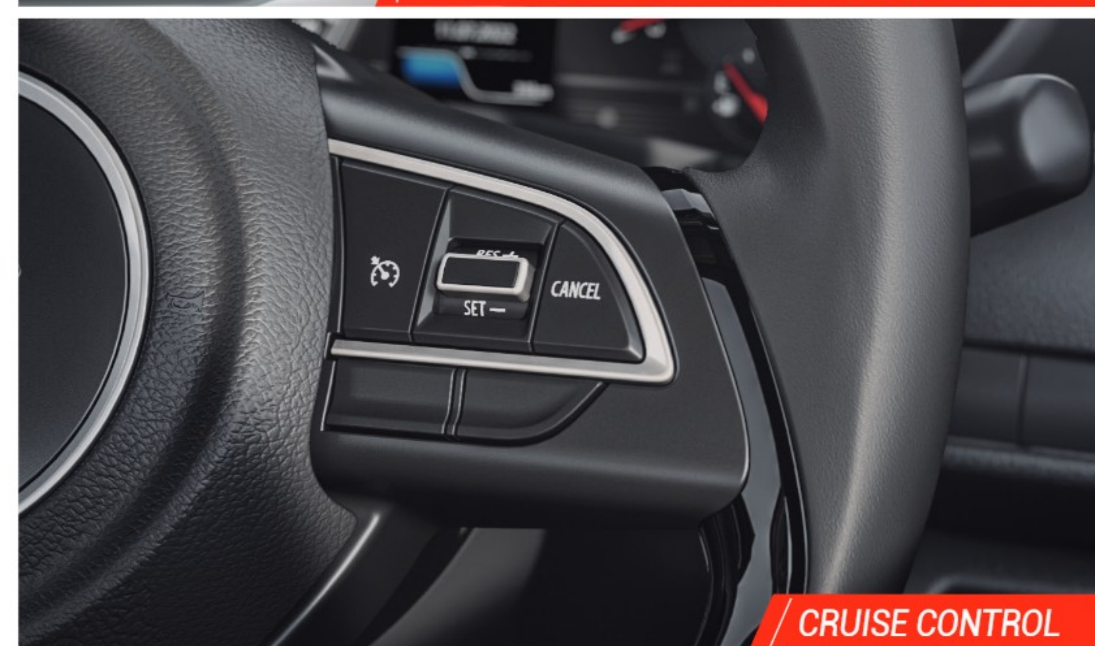
/ CRUISE CONTROL