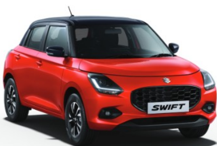
Sizzling Red with Bluish Black Roof