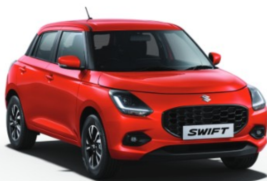
Sizzling Red 11