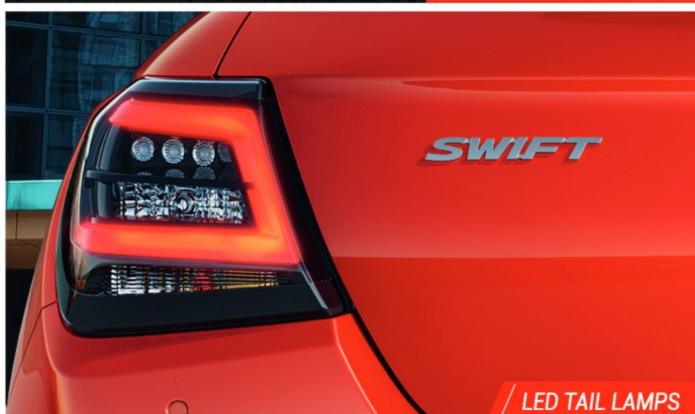
/ LED TAIL LAMPS