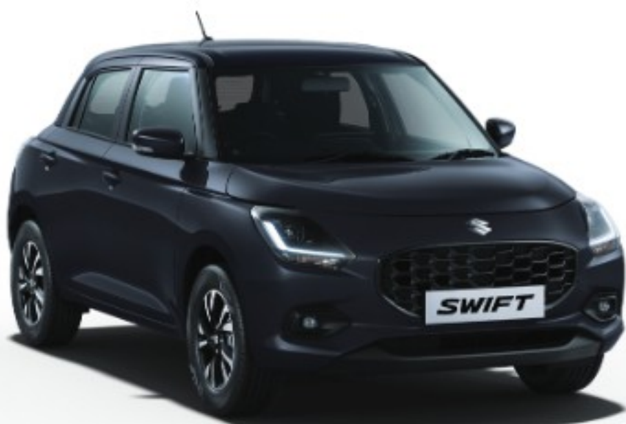
Bluish Black 11