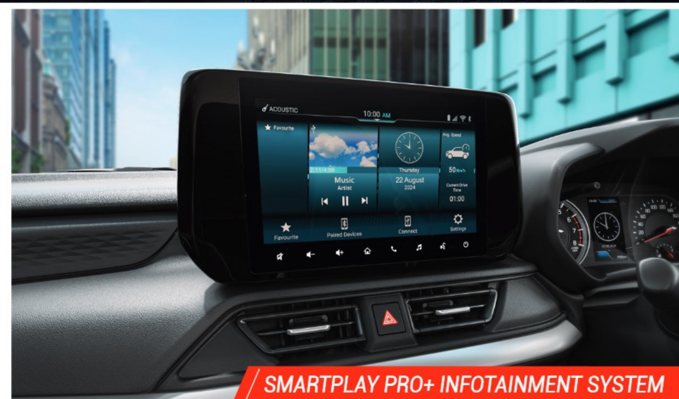
/ SMARTPLAY PRO+ INFOTAINMENT SYSTEM

No words can describe what you'll feel when you enter the Epic Swift. But we'll try. This car is designed with ample space keeping your comfort in mind and its Sporty All-Black Interiors make every drive truly stylish. The real head-turner is the sleek and futuristic center console, with a driver-oriented cockpit for easy access.