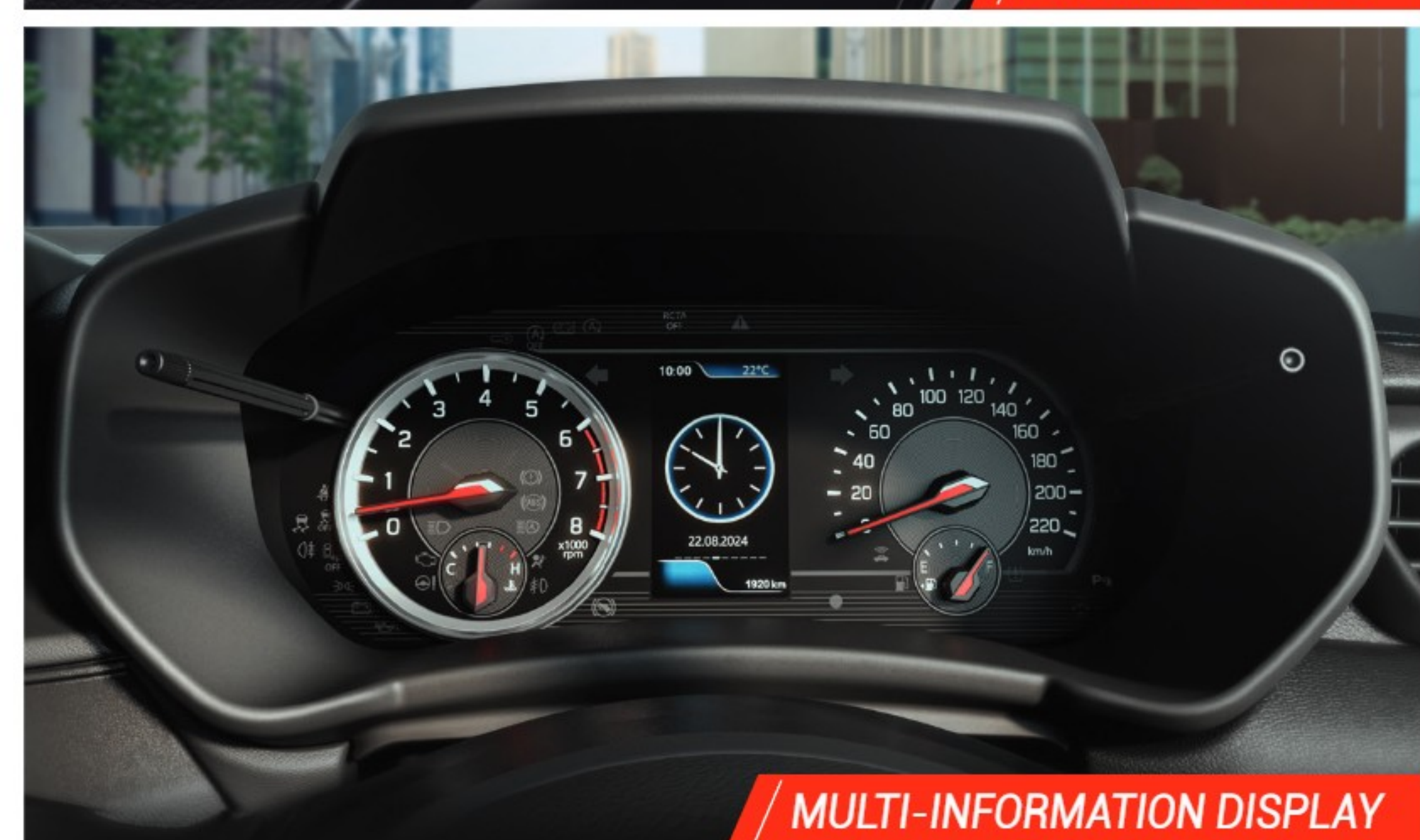
/ MULTI-INFORMATION DISPLAY