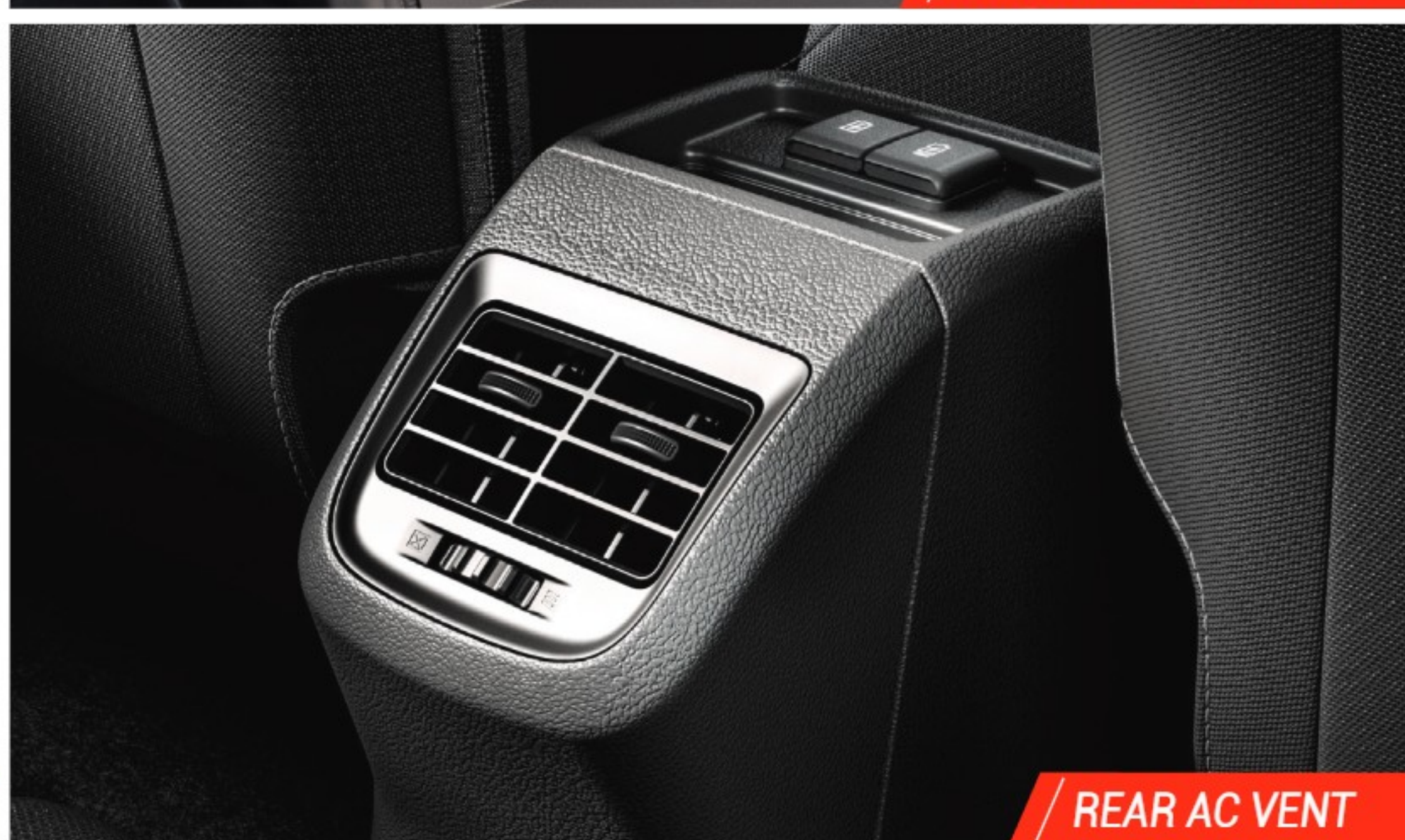
/ REAR AC VENT