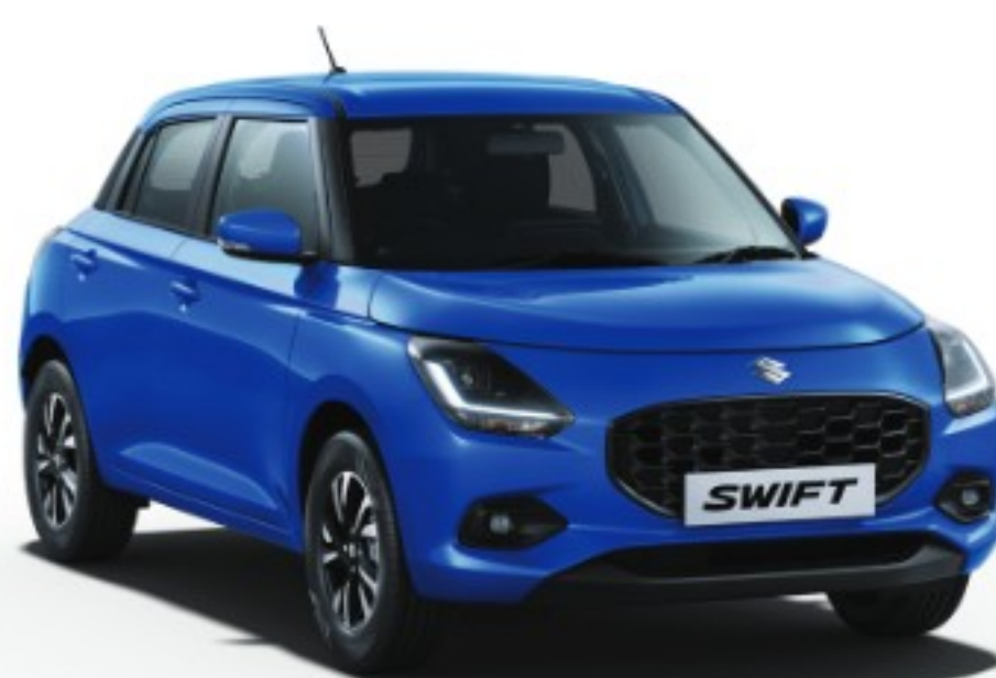
Luster Blue 11