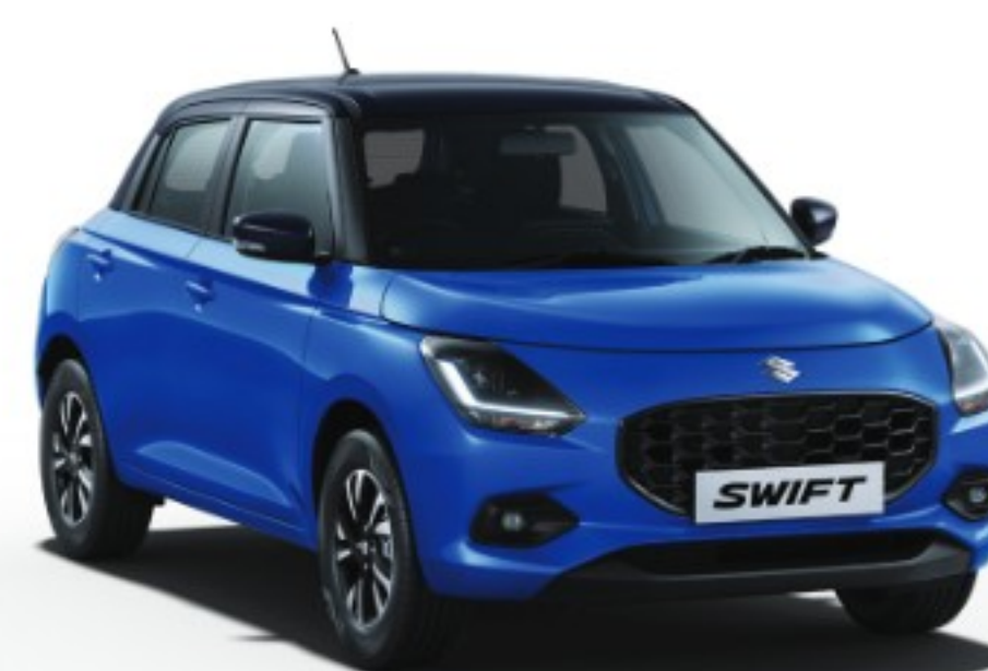
Luster Blue with Bluish Black Roof