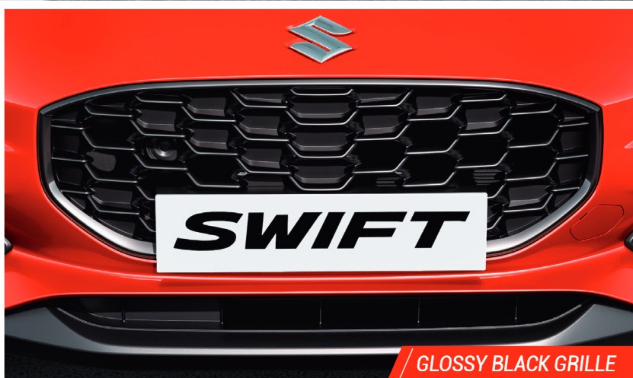
/ GLOSSY BLACK GRILLE