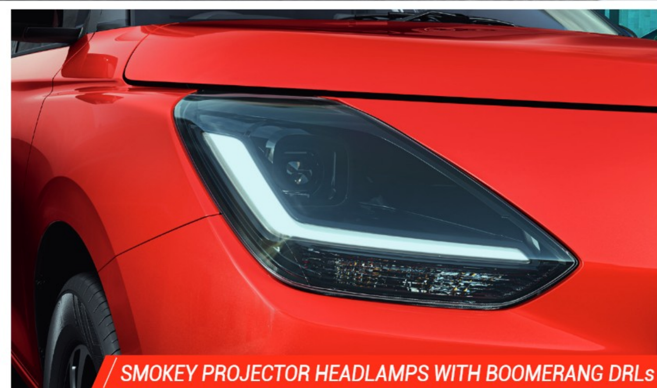
/ SMOKEY PROJECTOR HEADLAMPS WITH BOOMERANG DRLs

With its bold stance and sporty design, the Epic Swift is quite the looker. It is pure passion crafted into an expression of thrill. As it approaches, heartbeats go up, and you know it is something special.