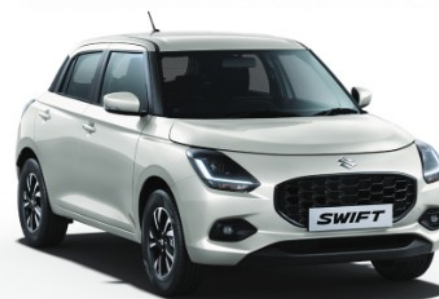
Pearl Arctic White