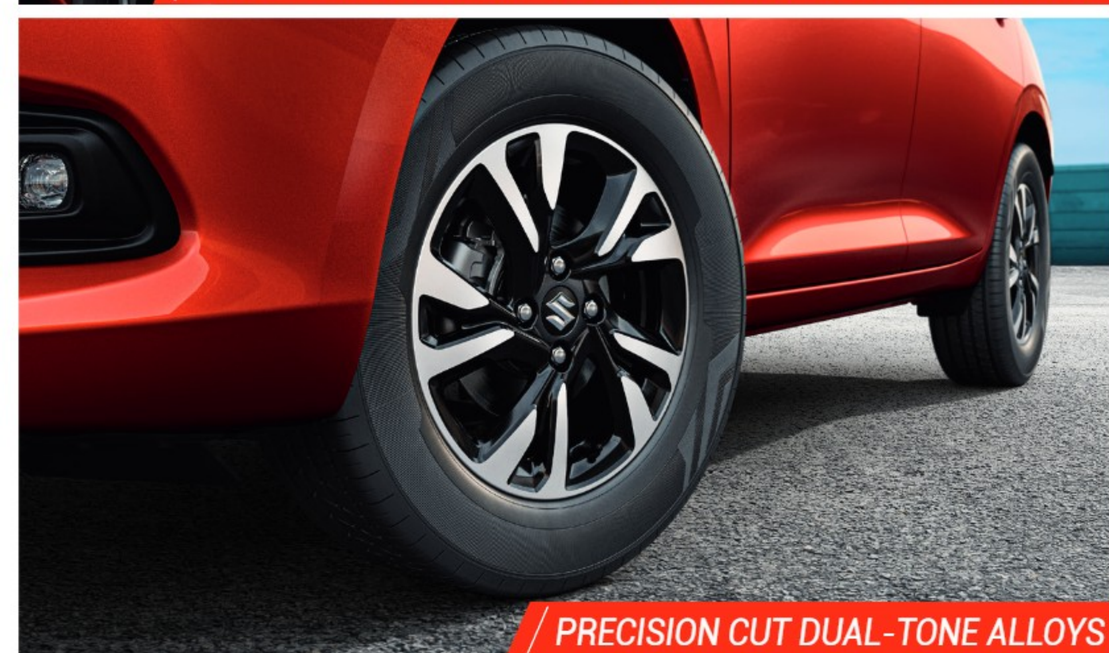
/ PRECISION CUT DUAL-TONE ALLOYS