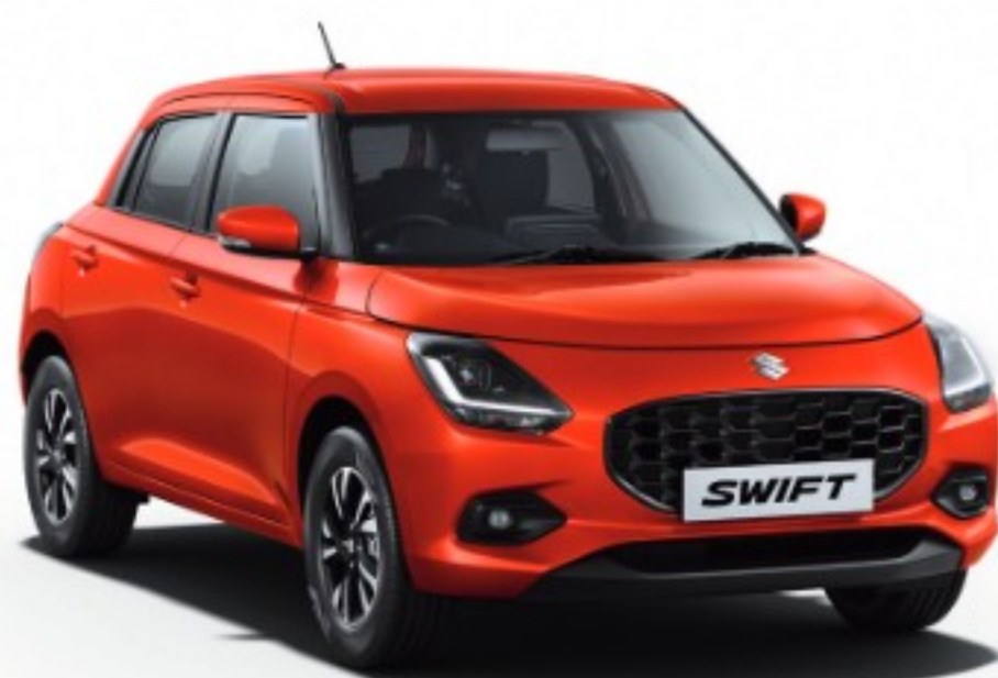
Novel Orange 11