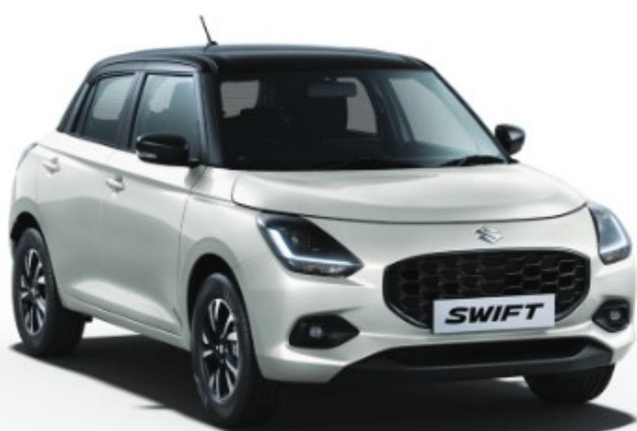
Pearl Arctic White with Bluish Black Roof