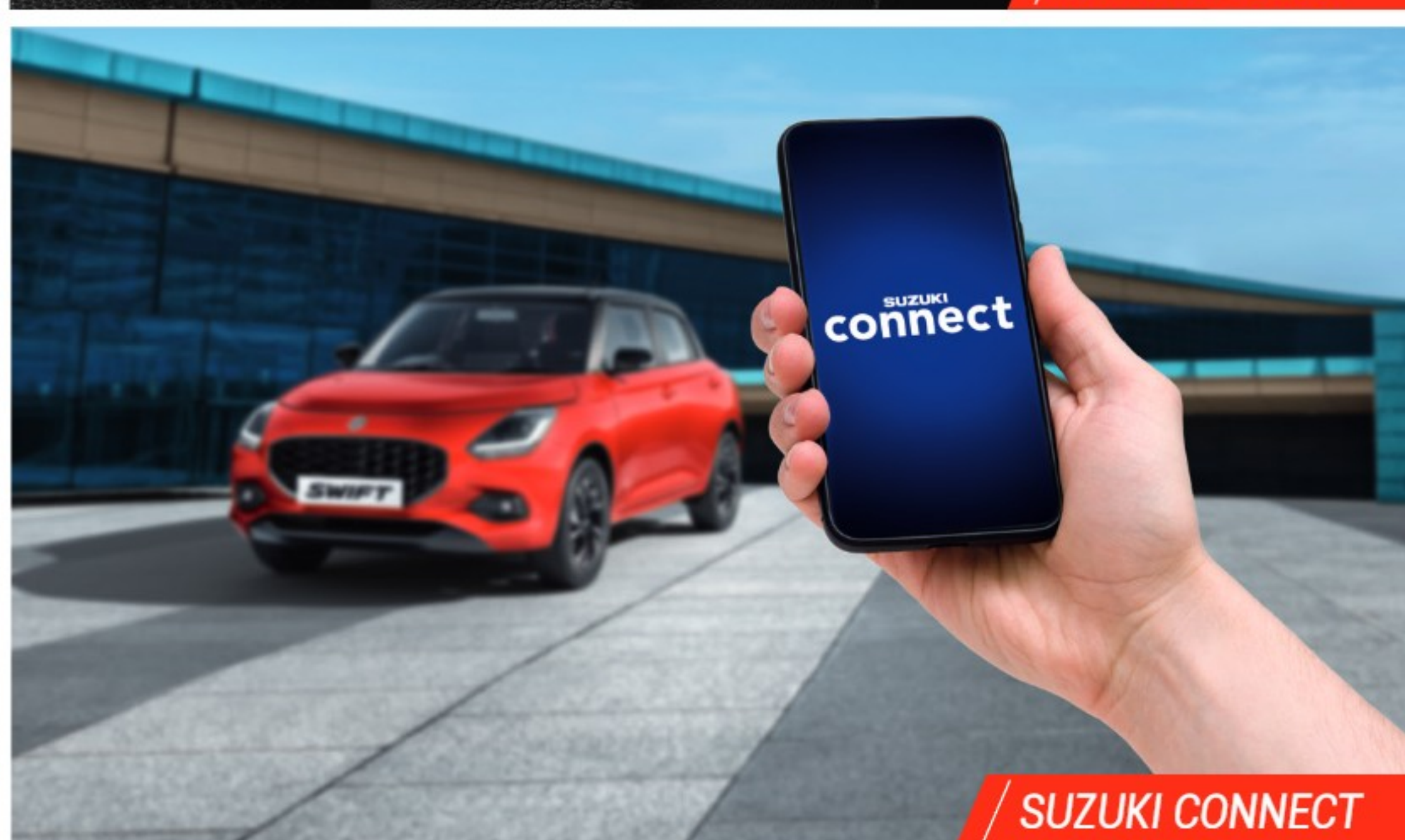
/ SUZUKI CONNECT